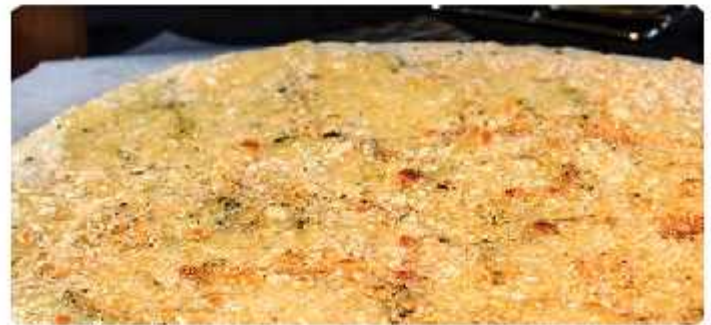
TRUFFLE PIZZA .....P429 White cream sauce, mozzarella cheese, parmesan cheese, and a drizzle of truffle oil.