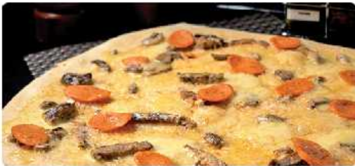
TRIO MUSHROOM with Italian Sausage .....P429 Trio mushroom sauce with sliced Italian sausage, mozzarella and parmesan cheese.