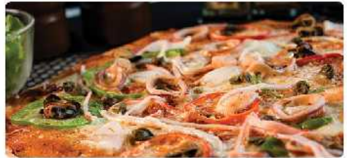
FRUTTI DE MARE .....P429 Shrimps, mussels, crab sticks, squid, bell peppers, onions, capers, mozzarella and parmesan cheese.