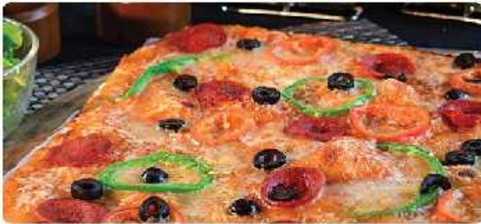
♥ PEPPERONI .....P429 Pepperoni with black olives, sliced tomato, bell pepper, mozzarella and parmesan cheese.

served with arugula, alfalfa sprouts, herbed oil and balsamic vinegar.